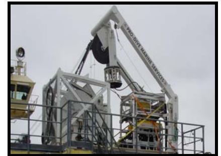
Cougar-XT LARS and TMS with Snubber Rotator

The snubber-rotator aligns the TMS for recovery by LARS.